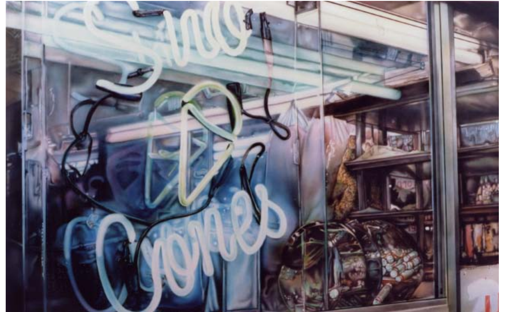
SNO-CONES 20" x 30" acrylic on crescent board