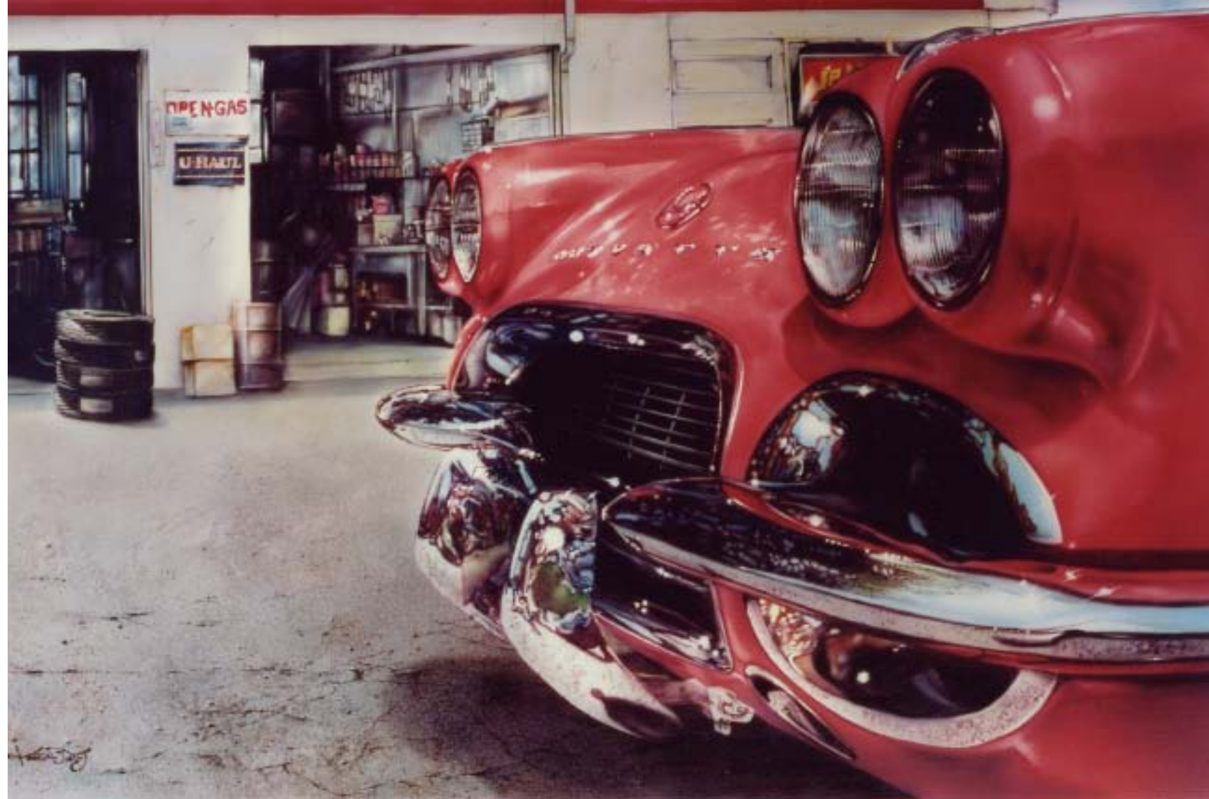
CORVETTE SUMMER 20" x 30" acrylic on crescent board