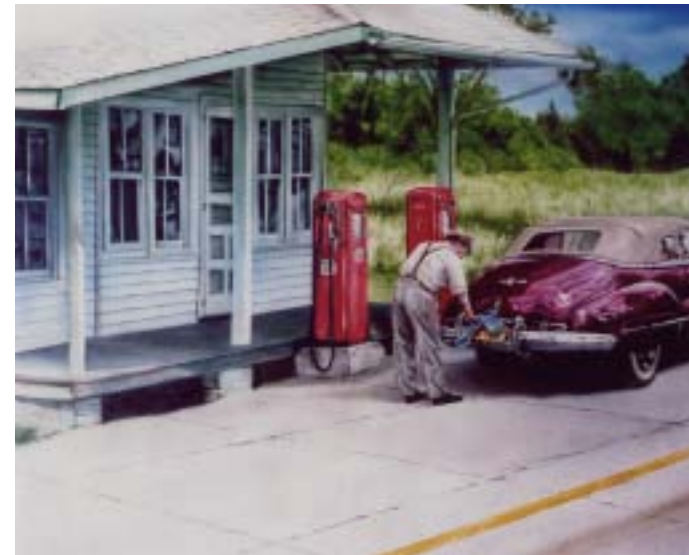
LAST GAS 16" x 20" acrylic on crescent board