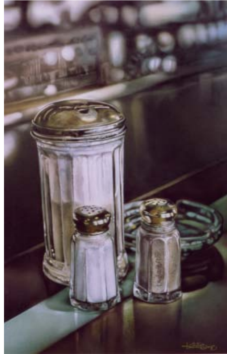
STANDING READY 20" x 30" acrylic on crescent board