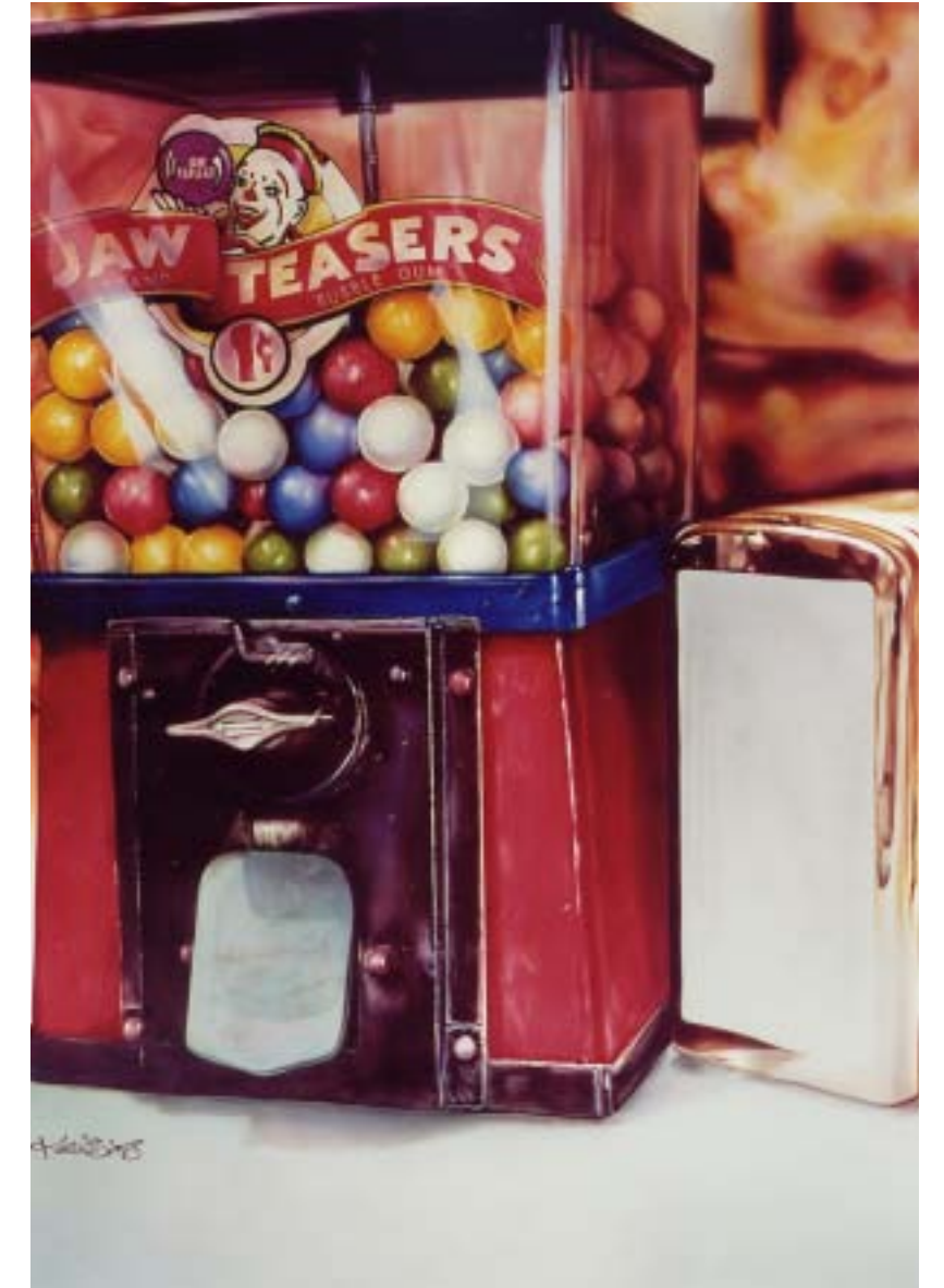
JAW TEASERS 20" x 30" acrylic on crescent board