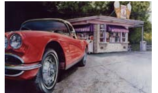
SWEET TREATS 20" x 30" acrylic on crescent board