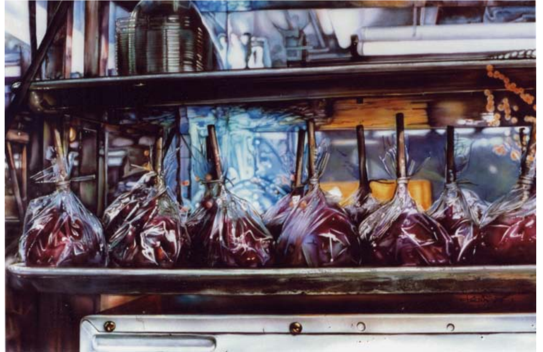
CARNIVAL SWEETS 20" x 30" acrylic on crescent board