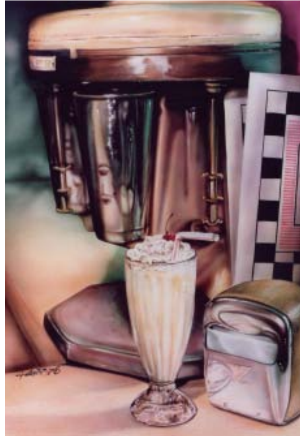
GREAT SHAKES 16" x 23.5" frisk board