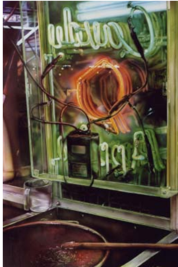
CANDY APPLES 20" x 30" acrylic on crescent board