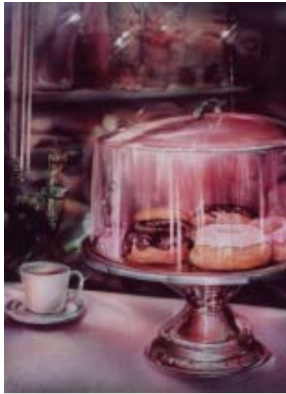
DINER DELIGHTS 16" x 20" acrylic on crescent board

Can you remember those special trips in the family car— summer vacation adventures with the whole family— or piling your best friends into Dad’s sedan for a trip to the drive-in theater—or a night out with that special someone? Along the highway we found friendly diners with waitresses who called you “Hon” and that “bottomless cup of coffee,” anytime of day or night.