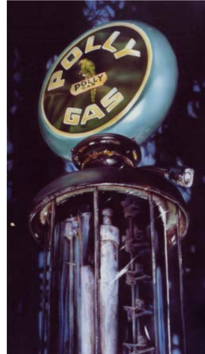
POLY GAS 20" x 30" acrylic on crescent board