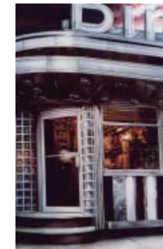
OPEN 24 HOURS 20" x 30" acrylic on crescent board

Some diners, however, seem to possess a lasting quality that have endured from one generation to another. Perhaps it was a special location, an unusual name or sign, or perhaps a specific clock or architectural design element. A diner could have become famous for a particular food item or a spectacular "character" that frequently "entertained" there. For whatever reason, the atmosphere is special in our most favorite diners, and for some reason they just seem to be classic.