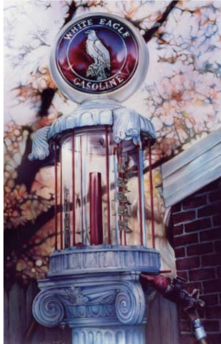
ROMAN COLUMNS 20" x 30" acrylic on crescent board

“Fill'er up! with high-test and check the oil please,” was a request I often made when touring along the highway. There was so much to see and do beyond the boundaries of our small towns, to see sights thought once too far to venture. Oh, how we traveled in those special machines.