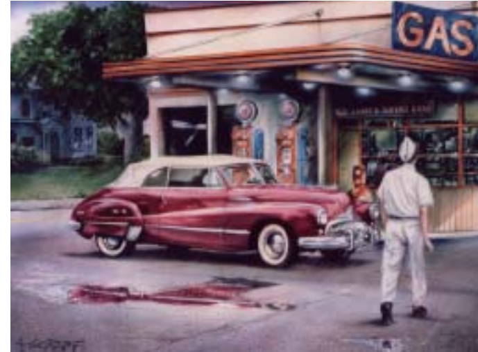
FULL SERVICE 16" x 20" acrylic on crescent board