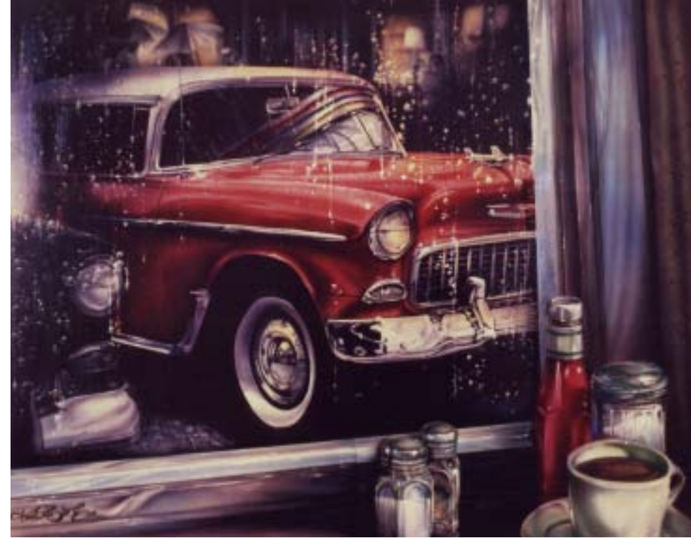
RAINY NIGHT COFFEE 16" x 20" matte film