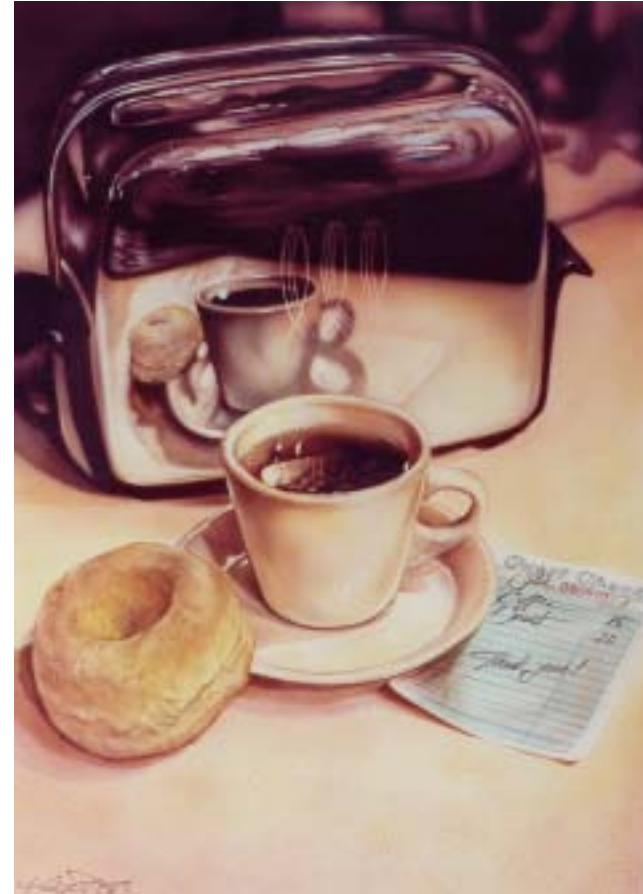
GUEST CHECK 16" x 22.5" frisk board