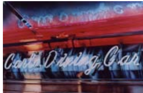
CARL'S DINING CAR 20" x 30" acrylic on crescent board

At dusk those wonderful neons glowed brightly calling us to eat, sleep, or play. An advertisement to be sure, we were thrilled by the colors and the art of the signs that beckoned us to a host of motor courts, eating establishments, fairs, carnivals and attractions alike. They were impossible to miss, easy to remember, and beautiful to see.