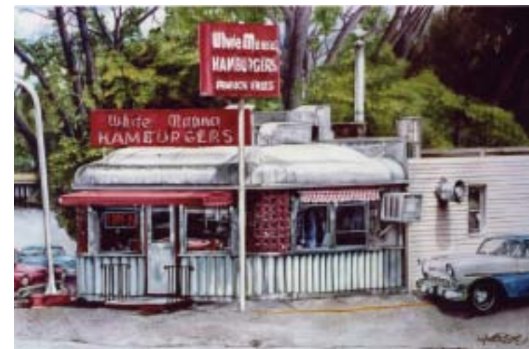
THE WHITE MANNA 20" x 30" acrylic on crescent board

Most classic diners reflect similar shapes, sizes and materials. Each have stools, booths and stainless steel back wall panels. All have dogs, burgers, and their soup of the day, made right in the kitchen. Each diner has its own special group of "regulars" - the breakfast or lunchtime locals, factory workers, the college crowd, or that traveling salesman.