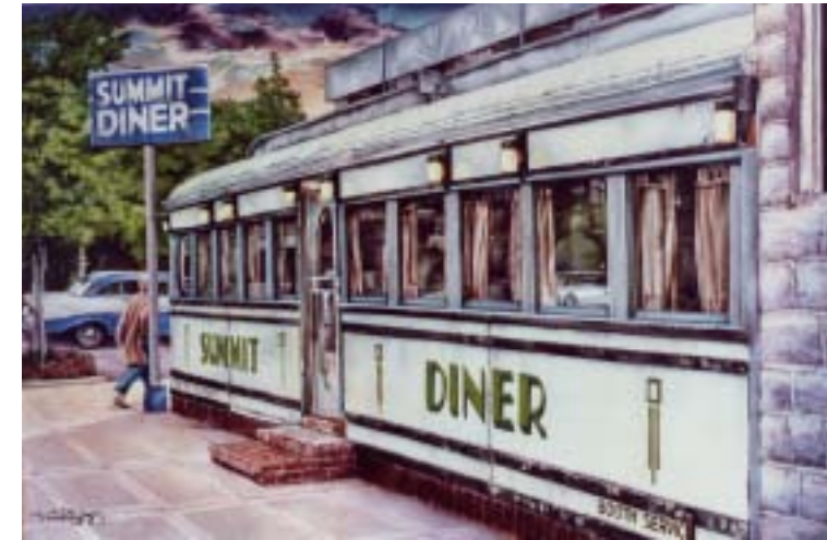
SUMMIT DINER 20" x 30" acrylic on crescent board