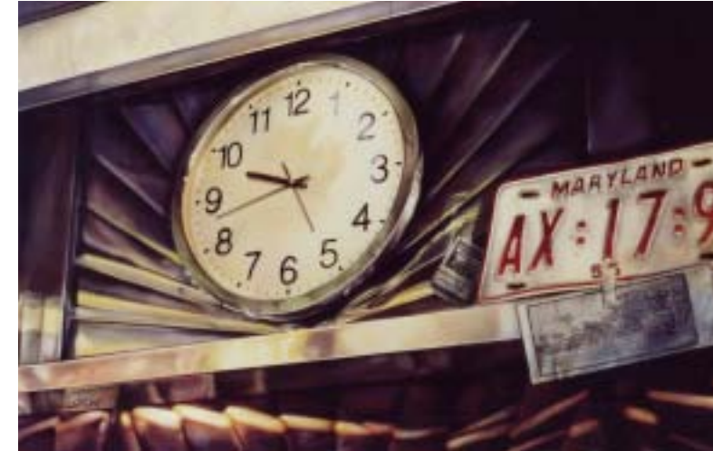
MY OLD TAGS 20" x 30" acrylic on crescent board