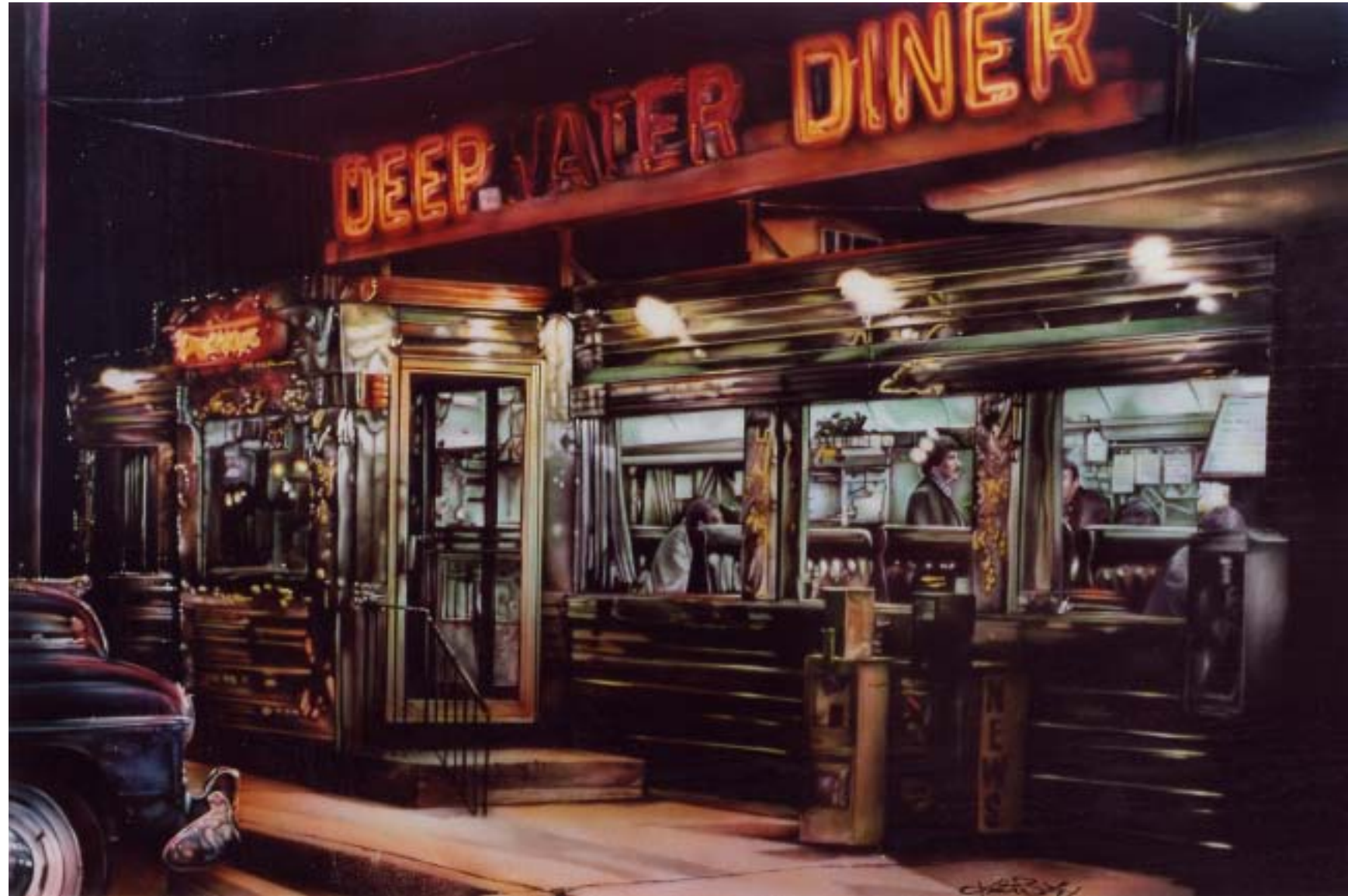
DEEP WATER DINER 20" x 30" acrylic on crescent board