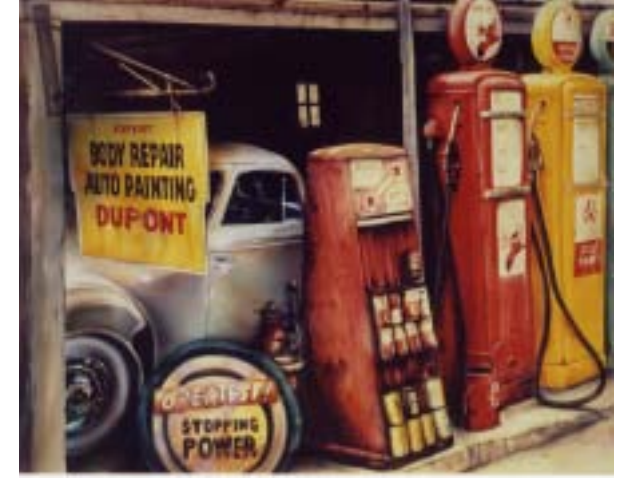
FIRE CHIEF 16" x 20" matte film